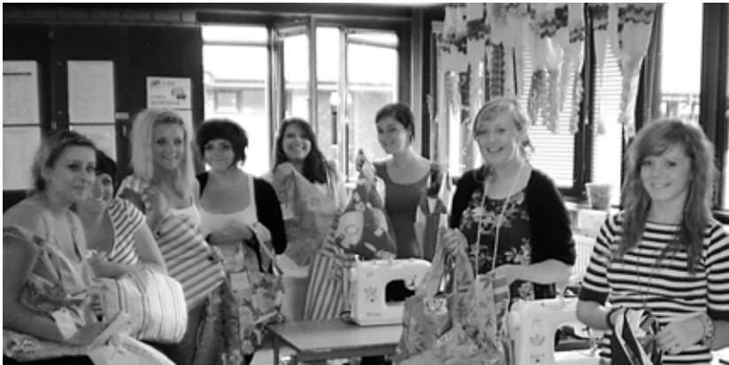
Students at William de Ferrers show off their wares after a gruelling 6 hours of 'sweatshop labour', August 2010.

'I now know that the clothes we wear have been crafted by highly skilled people and yet they don't get the credit or money that they deserve. Fashion is demanding, and now I believe that it is dark and a lot of greed comes from it. Brands worry about profit and customer satisfaction - not workers.'